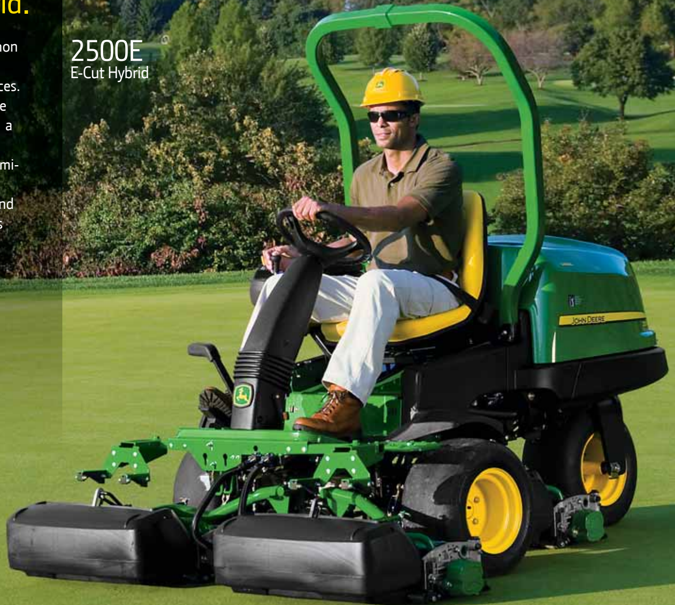
2500E E-Cut Hybrid

It's about advanced technology. And common sense. The 2500E E-Cut Hybrid is a hybrid mower that puts power in all the right places. With a choice of a gas or diesel engine, the 2500E E-Cut Hybrid powers the reels using a belt-driven alternator. By removing all the hydraulics from the cutting units, we've eliminated 102 potential leak points. And since 90 percent of all hydraulic leaks occur in and around the reels, the possibility of a leak is extremely remote.