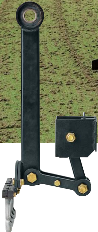
FLEXI-LINK This design keeps the tines perpendicular to the ground longer. The result? Hole quality that’s unsurpassed.