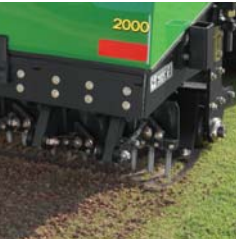
PRODUCTIVITY With the Aercore design, high productivity and hole quality go hand-in-hand. An Aercore Aerator can punch as much as 1.2 million holes an hour.